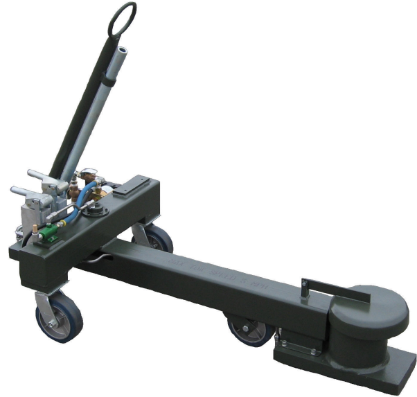
"Single-Acting" Axle Jack

Our single-acting axle jacks are used worldwide for all normal axle jacking applications for both narrow and wide body aircraft. With 6-inch casters, these jacks are highly maneuverable and include both dual hand pumps and an air pump for ease of operation. Included is our exclusive EVAC-U-TRACT™ cylinder retraction assist, making the single-acting jack cylinder function as a double-acting cylinder. This permits faster removal of the jack from under the aircraft, and with complete ram retraction the cylinder is better protected.